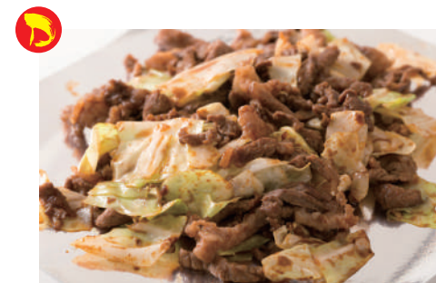
Fibrous beef and cabbage with hot sauce