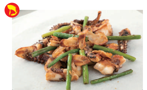
Grilled squid's legs with garlic soy sauce