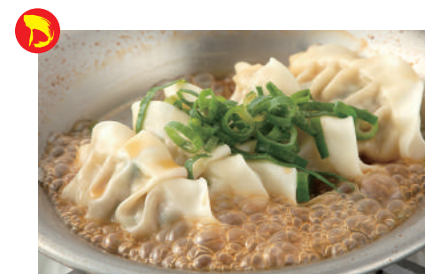
Boiled gyoza seasoned with yuzu-ponzu