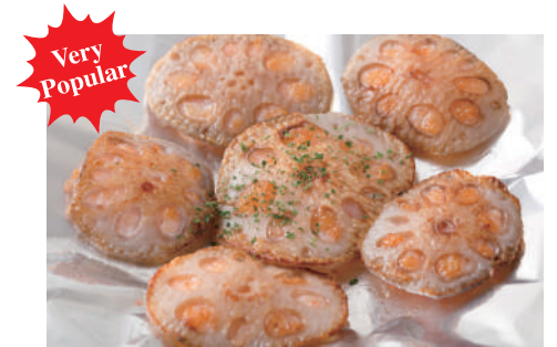
Lotus roof with shrimp