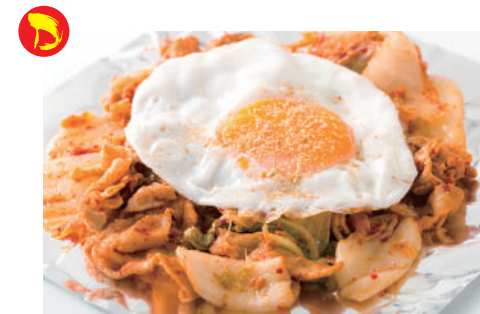
Pork and kimchee