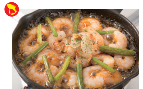
Shrimp with garlic and anchovy